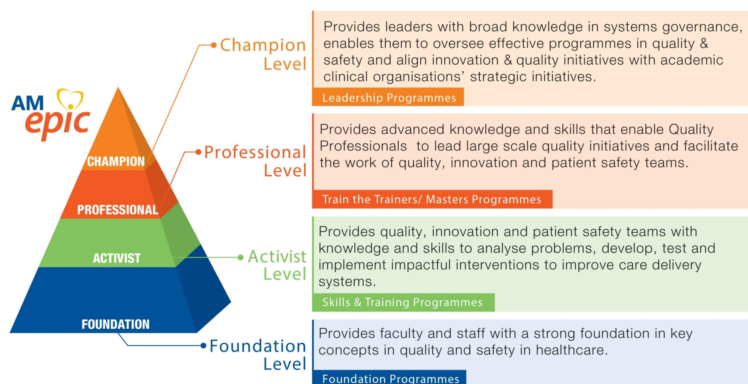
Fig.1 AM-EPIC competency framework for PSQ

A 4-Level PSQ competency framework (Foundation & Activist levels to Professional and Champion levels) has been created. (See Fig 1)