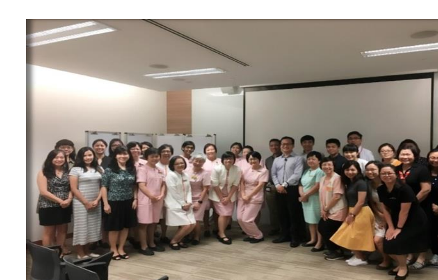
Fig.8. Essential Human Factors for the Healthcare Professional