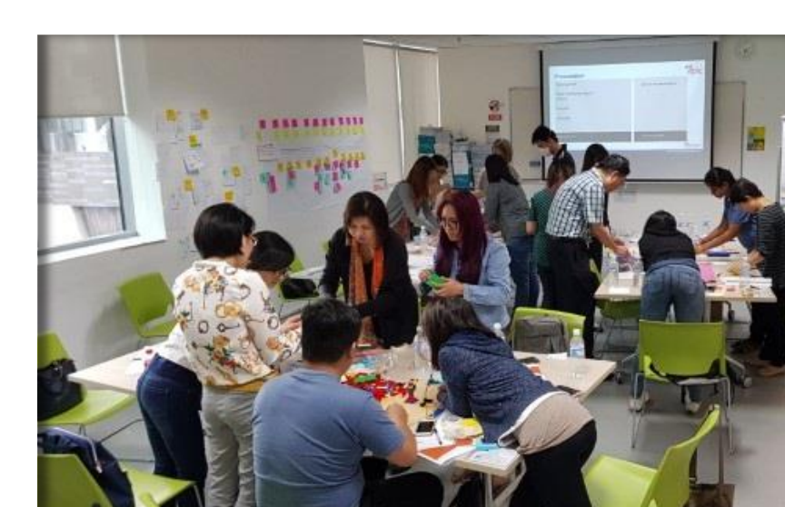
Fig.7 Introduction to Design Thinking Workshop