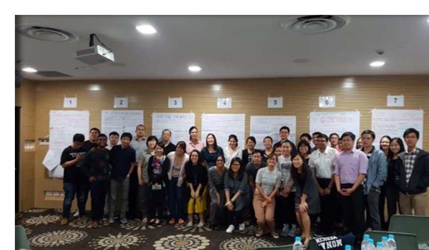
Fig.5 QI Workshop

Cross sharing of training manpower, resources and facilities at cluster level has been established. (See Fig 5,6,7,8)